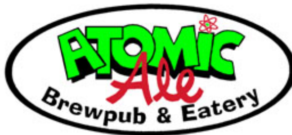
Atomic Ale Brewpub & Eatery