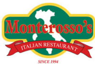
Monterosso's Italian Restaurant