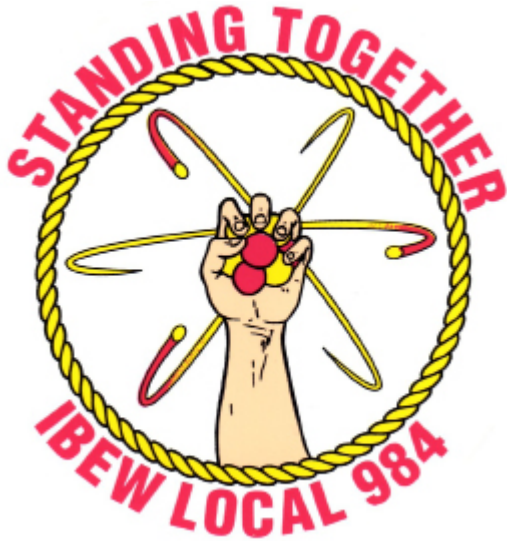
International Brotherhood of Electrical Workers Local 984

TCIF3 Would like to thank our Sponsors for making our Film Festival Possible.